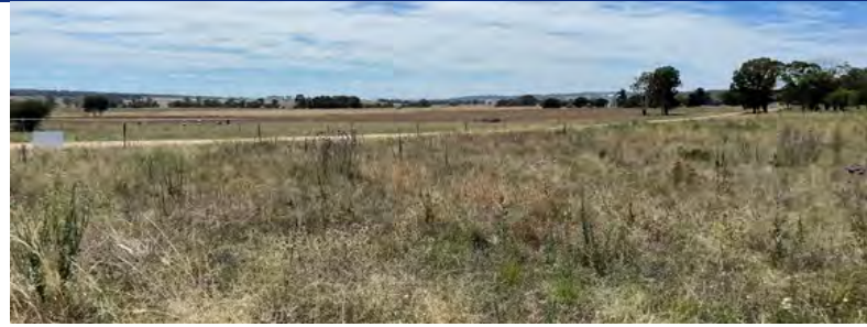
22 Dunedoo Street, COBBORA PRICE REDUCED $49,000