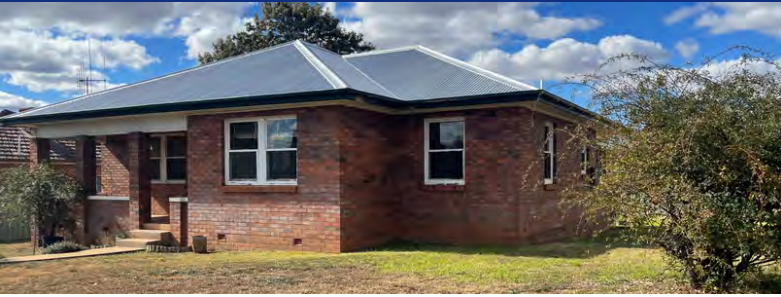
22 Wallaroo Street, DUNEDOO $360,000